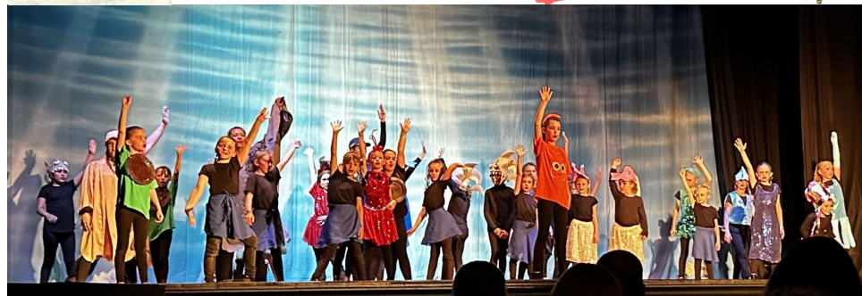
Finding Nemo Jr. Summer 2023